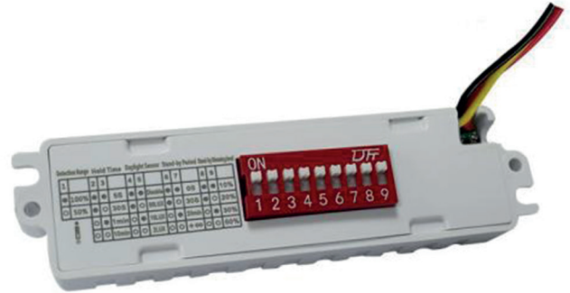
optional microwave sensor